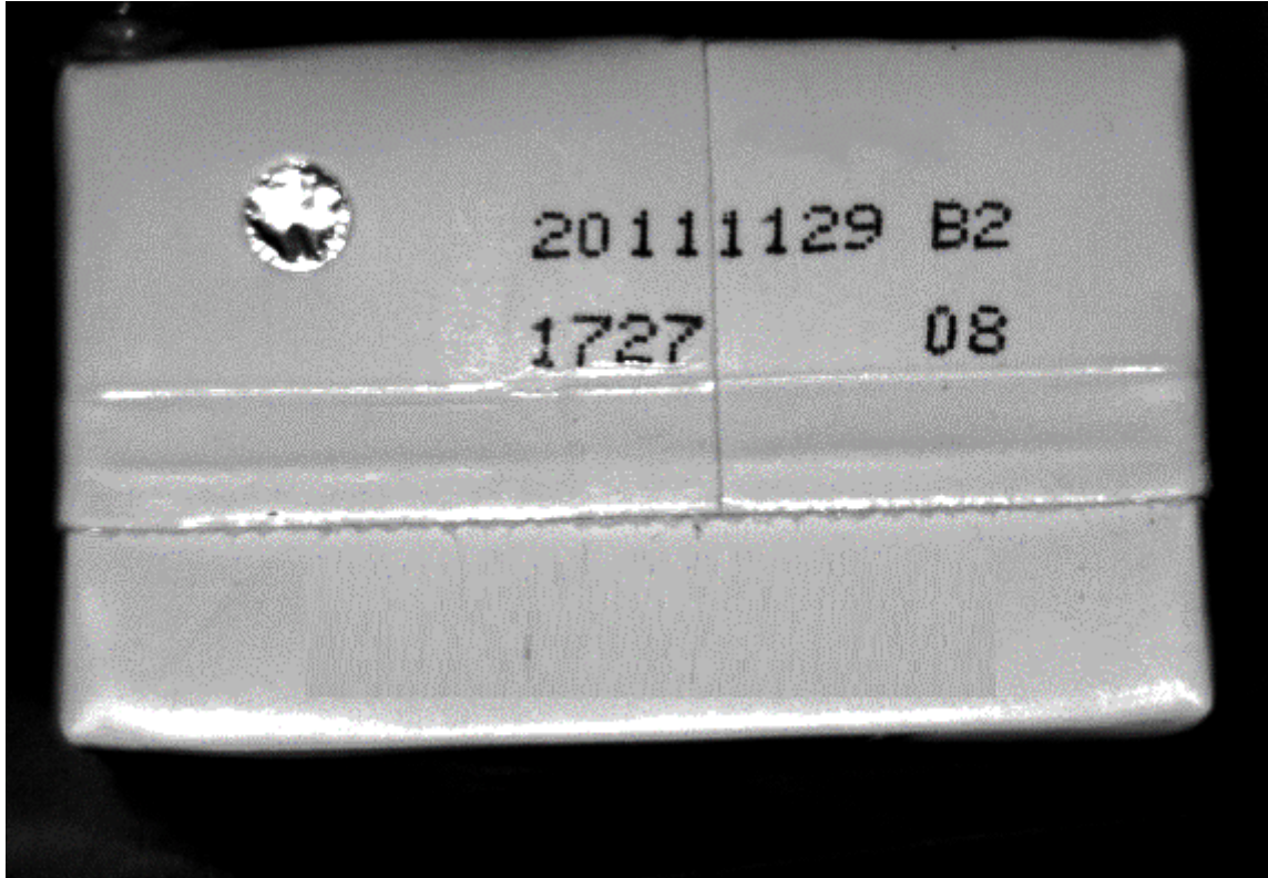
Production date inspection