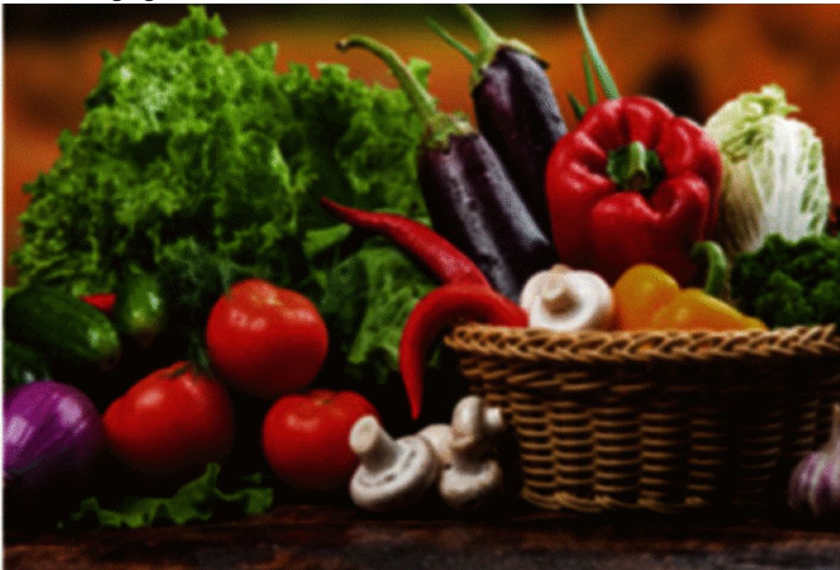
Other brand imaging effects