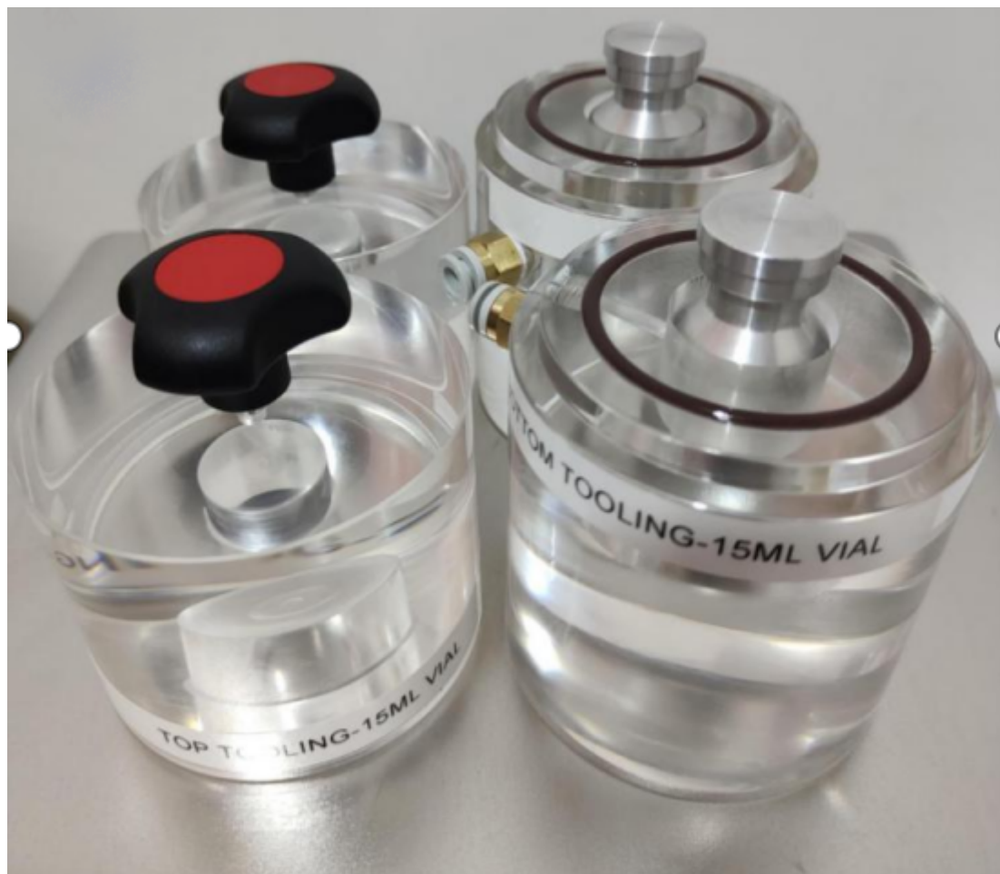
Attached picture 3 - Plexiglass cavity