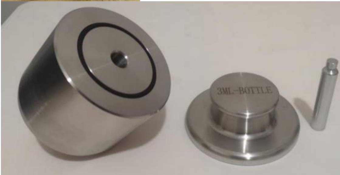
Attachment 2 - Stainless steel cavity