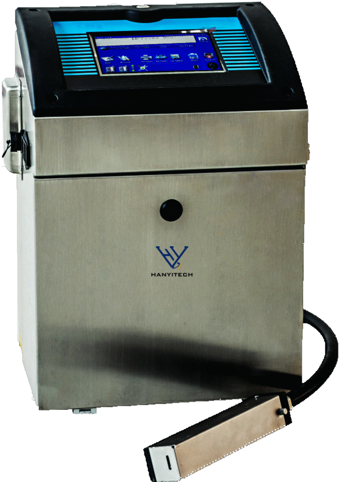
Economical inkjet printer