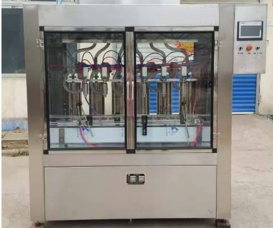
Automatic servo filling machine