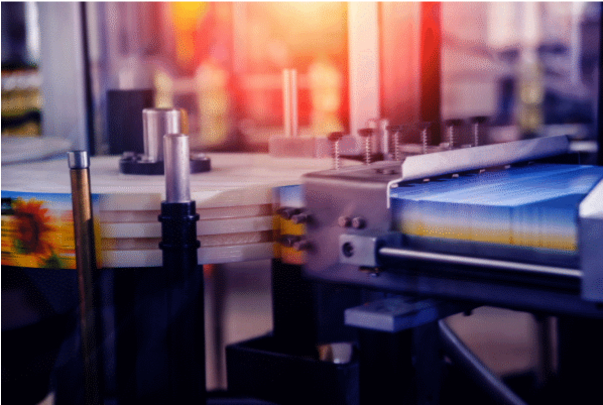
Automatic intelligent labeling machine