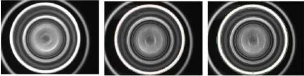
Empty cans image processing process