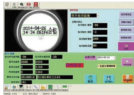
Inspection system interface