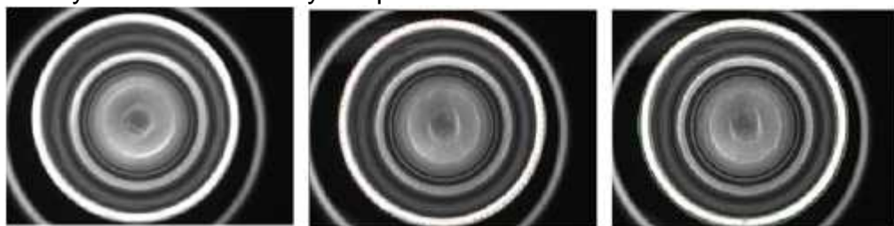
Empty cans image processing process