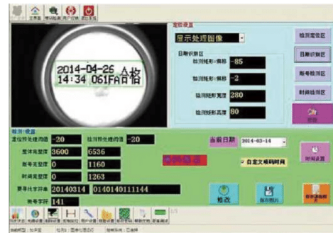
Inspection system interface